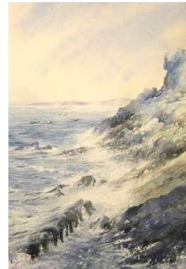
Off St Ives Head (Sold)