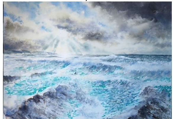
Winter Swell, Widemouth