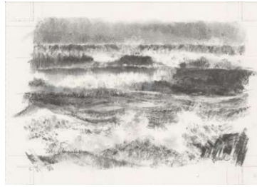
Lines Off Compass Point