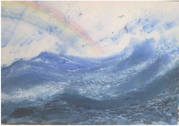
Heavy Swell and Off-Shore