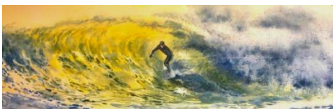
In the Green Barrel