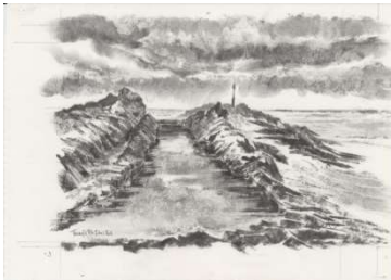
Tommy's Pit Tidal Pool