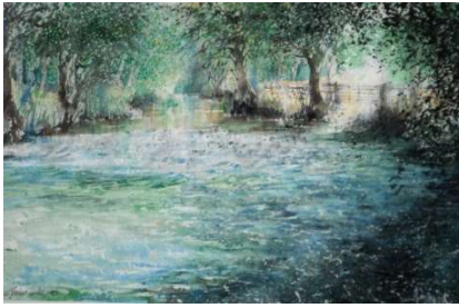
The Tamar at Dutson