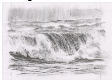
Millook Eowyn 2