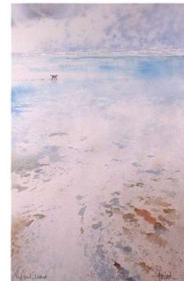
Wet Sand Northcott