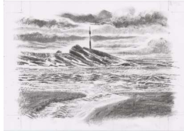
Barrel Rock Low Tide