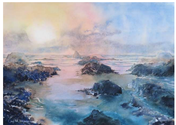
Camel Rock on a misty evening