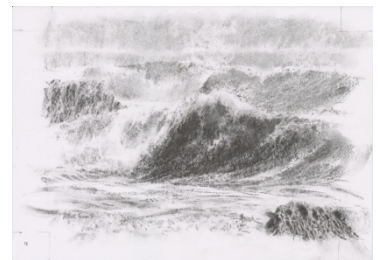
Millook Eowyn 3