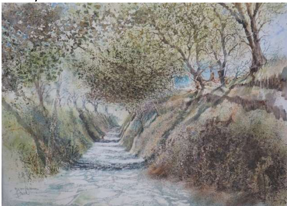
On a Lane to Altarnun