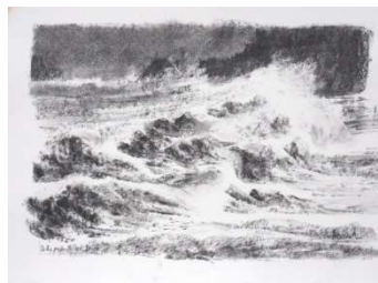
On The Push, Millook 2