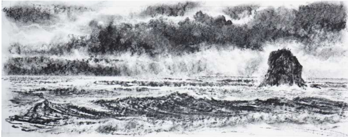
Black Rock Study