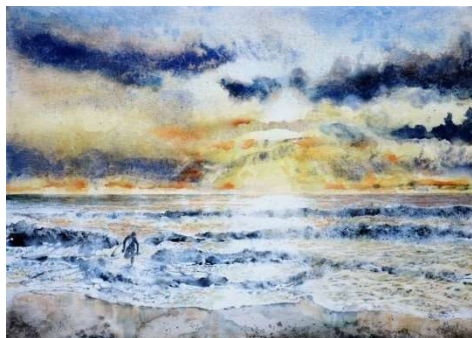
Just a Few More size 45 x 61 cm