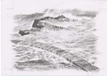
Bude Sea Pool