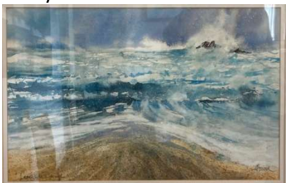
Camel Rock Study