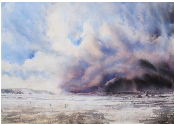
Approaching Storm, Widemouth