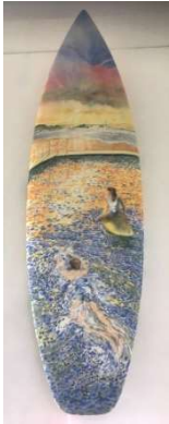
Bude Sea Pool – Evening Swim