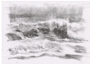
Off Philips Point