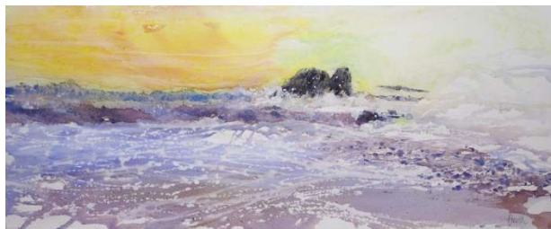
Camel Rock, size 40 x 100 cm