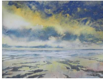
Soft Sunset, North Coast Price £280