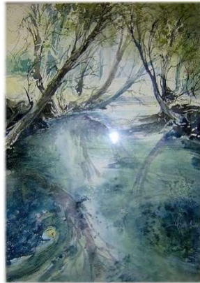
Into The Light