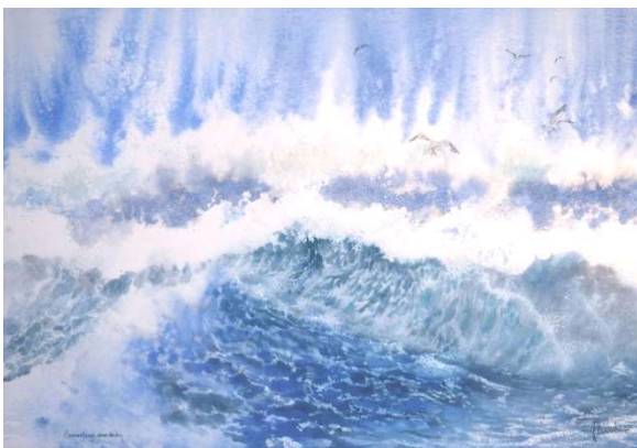
Summerleaze Wave Study