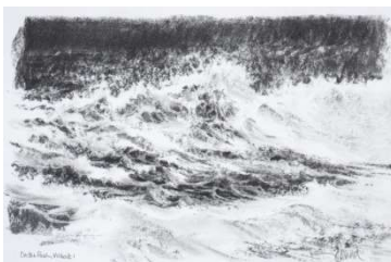
On The Push, Millook 1

Images 30x40cm approx. Warm white double mount within a black deep box frame Price £220