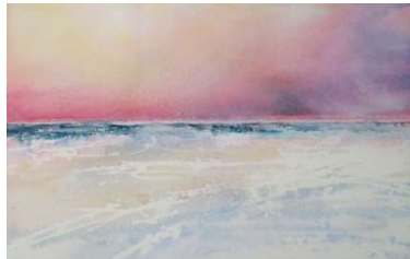
March Evening, Widemouth