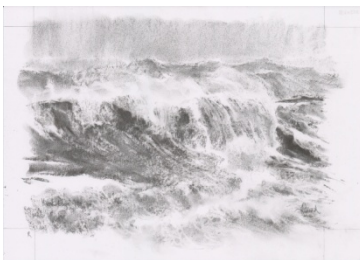
Millook Eowyn 1