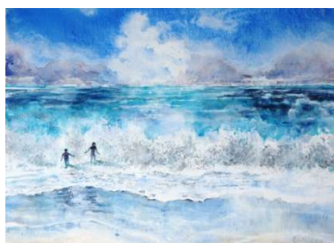
Jumping Breakers size 40 x 50 cm