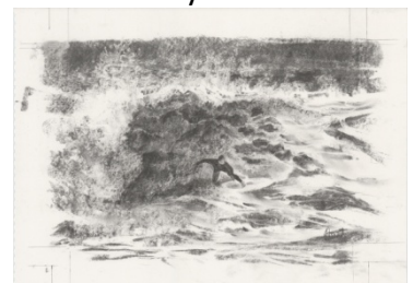
In The Pocket