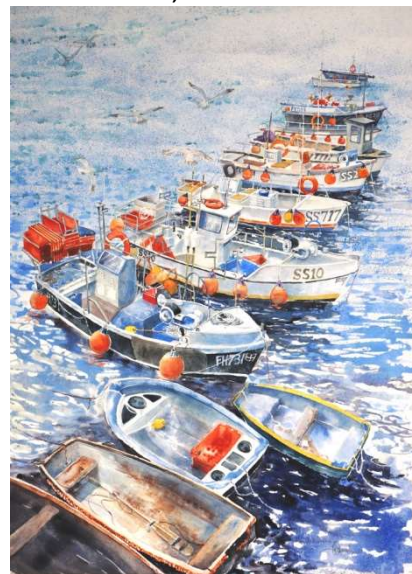
Many Red Fenders