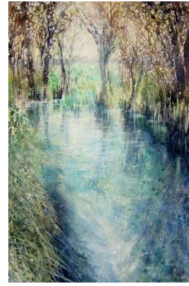
Spring Morning on the Brook