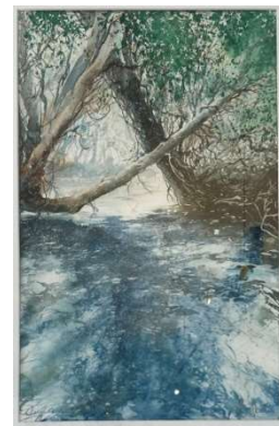
Below the Otter Pool