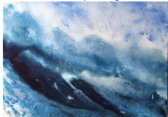
Heavy Swell at First Cove