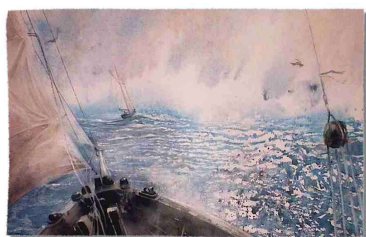
Close to the Wind