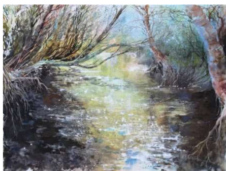
Henford Water (Ashwater) size 45 x 61 cm