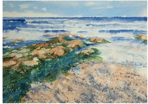
Salthouse Beach Study